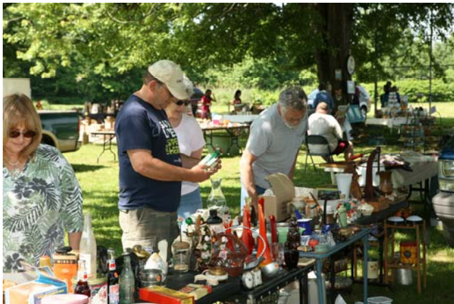
If They Don't Have It You Probably Didn't Need It.

It's summer, and that means the grass grows quickly, more traffic, and those pesky midges. On the upside, every Saturday from 9 AM to 5 PM the village hosts a popular Flea Market at the Rec Park, located at 5540 Lake Road East.