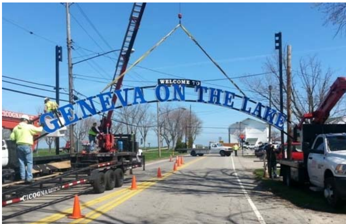
Workers from Cicogna Sign Hoist “Welcome” Sign Over State Route 534 Near the State Park Lodge

Anyone coming into town via the state routes can't miss the new bright blue “Geneva-on-the-Lake” arches which were constructed at the village's east and west corporate limits.